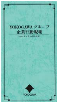
Standards of Business Conduct for the Yokogawa Group

During the process of recognizing and fulfilling its responsibilities as a good corporate citizen, the Yokogawa Group has come to realize that a good balance among the environment, society, and economy is becoming increasingly important. We therefore reviewed the "Corporate Code of Conduct for Yokogawa Electric Corporation" and drew up the new "Standard of Business Conduct for the Yokogawa Group Code" in June 2002 for all Group firms. The new code defines the following policies: (1) achievement of corporate philosophies, (2) customer satisfaction, (3) compliance with laws, regulations, and rules, (4) respect for human rights, and (5) order and safety in civil society. It also defines the following relationships: (1) relationship with customers, (2) relationship with stockholders, (3) relationship with communities and society, (4) relationship with suppliers, (5) relationship with competing companies, and (6) relationship with politics and governments. It referred to global environmental protection in (3) relationship with communities and society. Based on these policies and relationships, this "Corporate Code of Conduct" offers guidelines for conduct. These guidelines do not contain "must not" expressions. Rather, they encourage employees to act proactively to establish corporate ethics. At our offices in countries outside Japan, the code of conduct applies in view of local laws, customs, religions, and other aspects.