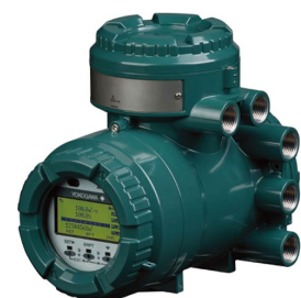
AXG4A Magnetic Flowmeter Remote Transmitter