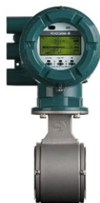
AXG Magnetic Flowmeter Integral Type