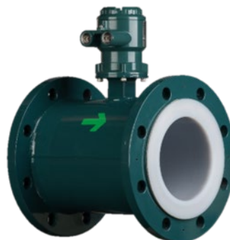
AXG Magnetic Flowmeter Remote Sensor