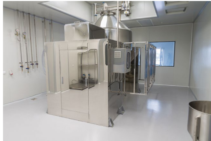
Clean room vendor