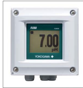
Type: 2 wire type

If the total amount of chlorine in the system remains constant, but the pH changes, there will be a corresponding change in the measured ORP reading. Therefore to us ORP to control chlorine addition we must compensate the measurement for changes in pH. The simplest way to do this is substituting a pH electrode for the reference electrode used with a FLXA21 or FLXA402 configured for ORP service. This technique is only valid over a narrow range pH 6.5-8.0, and should only be used in simple systems that operate at stable temperatures. (The measurement is not compensated for temperature changes.) It should not be used in situations where there may be a large change in background composition such as wastewater streams or treatment ponds. Figure 1 shows typical ppm chlorine levels verses mV reading values.