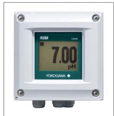
Type: 2 wire type