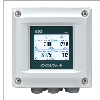
Type: 4 wire type