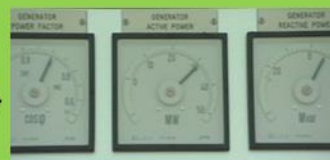
Generation of electricity