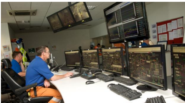
Central control room

With the integration of the Yokogawa CENTUM CS 3000 and ProSafe-RS systems, operators in the central control room enjoy ready access to operations throughout the plant. Ergonomically designed CS 3000 human interface stations (HIS) provide a window into all of this facility's processes, giving operators real-time access to all the information they need to make quick and timely decisions.