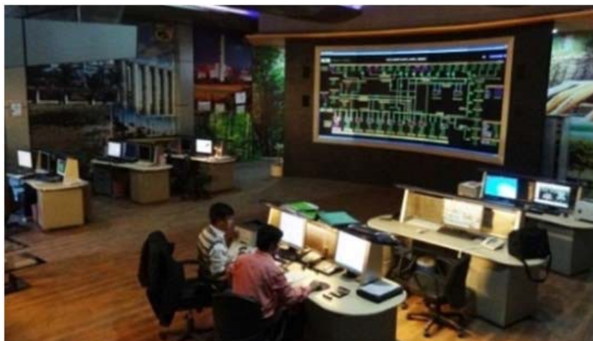
National Gas Management Center

Today all pipeline networks can be monitored and controlled centrally from the NGMC using the reliable FAST/TOOLS data communication package. The FAST/TOOLS system at the MMS has also been integrated with a gas management system (GMS) so that all operation data can be directly utilized for gas allocation and billing. Email and short message service (SMS) notification of critical alarms is supported, and authorized persons have access to this SCADA system anywhere an Internet connection is available.