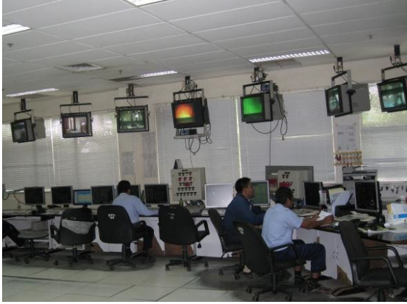
The central control room as it looked before the upgrade to CENTUM VP

Yoshihiko Katagiri, the PT. TEL General Mill Manager, said, "We are very satisfied with Yokogawa's control system and products. They have proven to be highly reliable, allowing our digester to operate at all times. We use large screens to display key operation data and the individual operators all have access to their own HMIs. The HMI screens are all ergonomically designed, allowing operators easy access to all kinds of data. The display of this data on the HMIs is very smooth. In many different ways, CENTUM VP is very easy and comfortable for our operators to use."