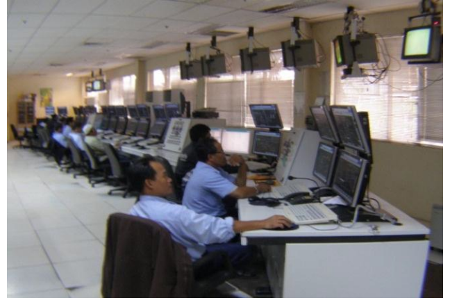
The central control room today with ergonomic designed HMIs. The more data, the less operator workload