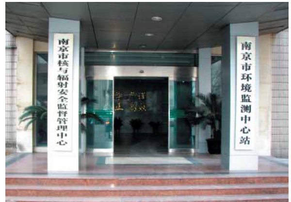
Nanjing Municipal Environment Monitoring Center

NMEMC is the first organization in the country to issue weekly public reports on air quality and the first city-level surveillance station in the country to provide weekly and daily air quality forecasts.