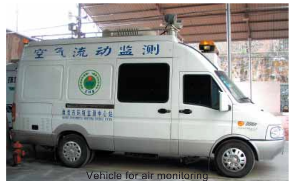
Vehicle for air monitoring

A system was needed that could easily connect with existing 3 rd party SCADA software, offering protection against most common Ethernet and TCP/IP layer attacks, and was stable under most network conditions. With its capability to integrate commercial-off the-shelf components and use of a non-Windows operating system, STARDOM fulfills these key requirements, ensuring the reliable and secure collection of environmental data. As no fans are used in the controllers, they also exhibit excellent aseismic characteristics and are suitable for use in air quality monitoring vehicles.