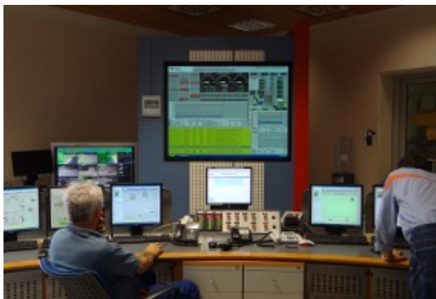
Central control room

Yokogawa successfully installed CENTUM CS3000 production control system (PCS) to manage nearly 6000 I/Os and 10,000 I/Os from 25 sub-systems through OPC interface. And Enel GEM challenges field digital technology for their predictive maintenance in their asset management system.