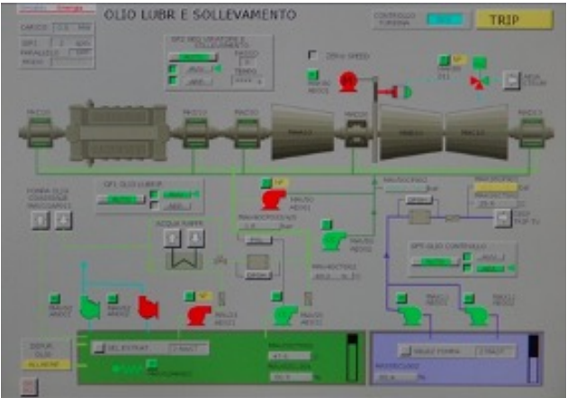
Graphic display Steam turbine

Regarding the environmental impact, operators are aware of the importance of the pollution limits. If the plant exceeds the limits, they take immediate counter-measures. The most important limits are about CO average hourly concentration (max. 30 mg/m 3 ) and NO x average hourly concentration (max. 50 mg/m 3 ). There are also limits on pH, temperature and chlorine concentration of wastewater. Seamless integration is contributing to improve CCPP efficient operation.