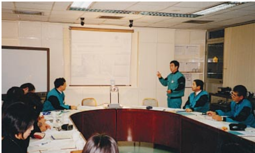
Japan-China 3Es Research Project

This is a joint research project between Keio University (Japan) and Tsinghua University (China) under the name of "Japan-China 3Es (Energy, Environment, and Economy) Research Project." Suzhou Yokogawa Meter Co. (SYC) was selected as the model corporation for this study on environmental accounting, and will thus help promote environmental accounting in China. China is undertaking major developments in its western region and is building the infrastructure for economic growth and prosperity. However, the plans inevitably involve energy concerns and environmental issues. The project was set up to study ways of managing development and maintaining a balance between the budget and the environment, as well as avoiding pollution problems incurred by advanced nations and protecting the global environment.