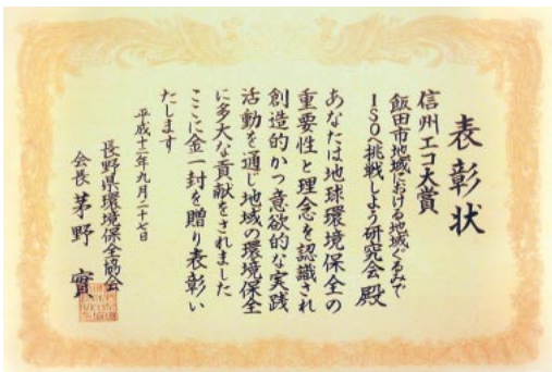
Shinshu Eco Grand Prize

Yokogawa Precision Corp. in Nagano Prefecture, Japan is cooperating on the Regional ISO Learning Workshop, and providing advice and support to local companies and organizations that aim to obtain ISO14001 certification as a leader of the ISO Certification Acquisition Support Subcommittee that is part of this workshop. These activities won Yokogawa Precision the Shinshu Eco Grand Prize in 2000.