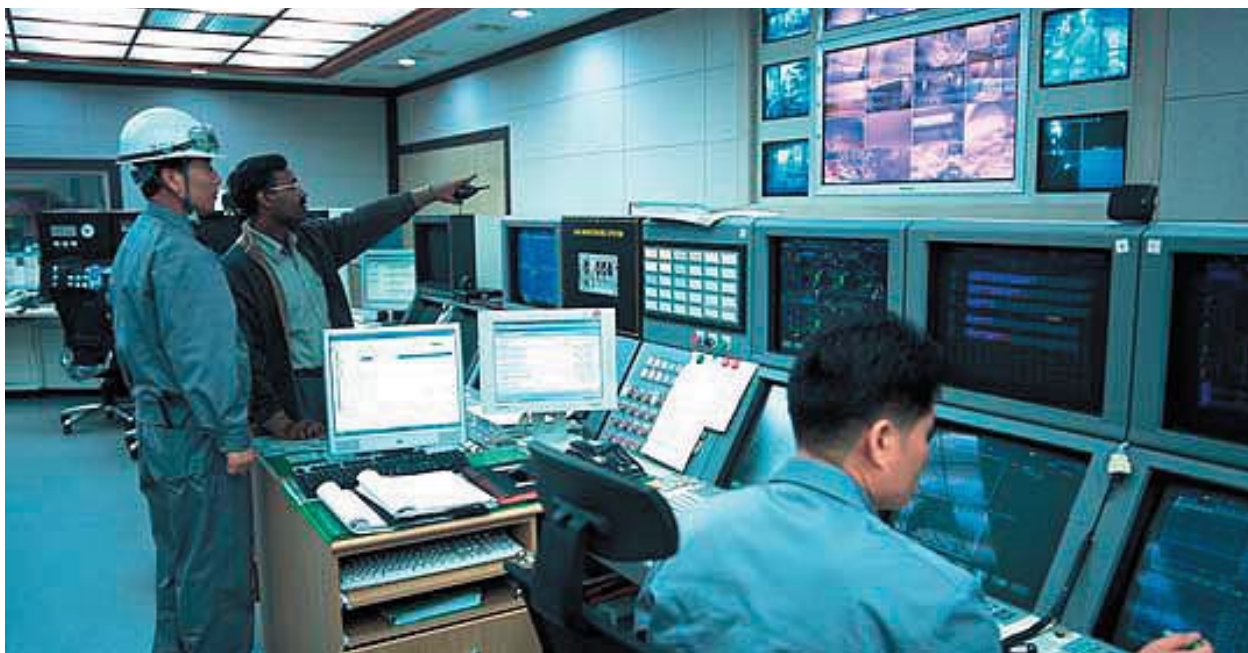
Central control room

At the company's Ulsan resin plant, six Exaquantum servers were connected to CENTUM CS 3000 and Honeywell TDC 3000 systems as well as PLCs from other suppliers. Exaquantum servers were also installed at the company's resin and rubber plants in Ulsan and Yeosu. At the company's SBC plant in Ulsan, Exaquantum/Batch along with a four-client system that provides KPI and historian data for up to 50 polymer batch products were introduced. In addition a limited number of Exaquantum clients were installed at the company's head office in Seoul.