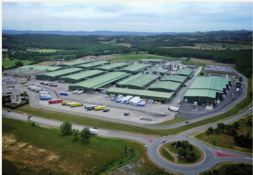
Fig. 1: Headquartered in Andrézieux, France, SNF is the world's largest polyacrylamide manufacturer.

In recent years, SNF has achieved major sales growth in the area of chemical enhanced oil recovery (CEOR). Chemical injection is used to increase the amount of crude oil extracted from oil fields. Rather than try to force oil