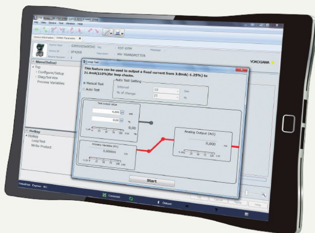
Fig.4: FieldMate is a state-of-the-art, FDT-enabled device management tool that supports intelligent instrumentation tasks such as performing loop checks.

FieldMate device tool is loaded on a tablet and used to assist with initial configuration and commissioning. All device configuration data is saved for future reference once commissioning is completed, and the device tool's audit trail function is useful in identifying human error in case of future problems. Because the device management solution leverages the open, protocol-independent FDT standard, it is ideal for skid environ-