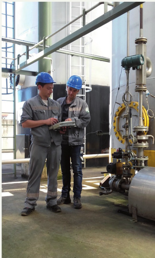
Fig.3: Field maintenance staff at the Andrézieux site can now manage the complete lifecycle of assets and configure devices via a standardized graphical interface, with information accessed from their tablet.

lifecycle of assets and configure devices via a standardized graphical interface, with information accessed from their tablet. It can also perform offline configuration, and when devices are connected during commissioning, parameter sets can be loaded to individual devices – saving an enormous amount of time.