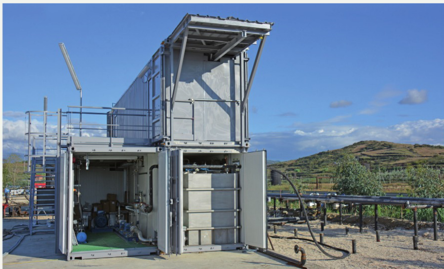
Fig.2: SNF has developed turnkey polymer injection skids, which can be set up directly in oil fields.

results is to make certain that all installed assets are used to the best of their ability. In order for plant operations to run smoothly, solutions that streamline processes and workflows must be in place. Additionally, accurate representation of installed equipment assets must be available. Plant owners and operators are seeking tools to support effective and efficient maintenance and operations management.