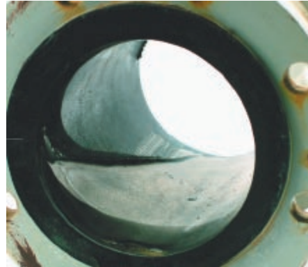
Photo A: Example of liner wear at low velocities. Because of ADMAG's retained liner design, this meter continued to function.