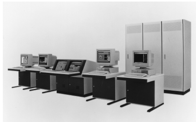
Figure 1 CENTUM CS 3000

Now, as an evolution from the CENTUM CS 1000, we have developed the CENTUM CS 3000 process control system that is capable of controlling a large-scale plant. Featuring de facto standard functions and armed with control functions further